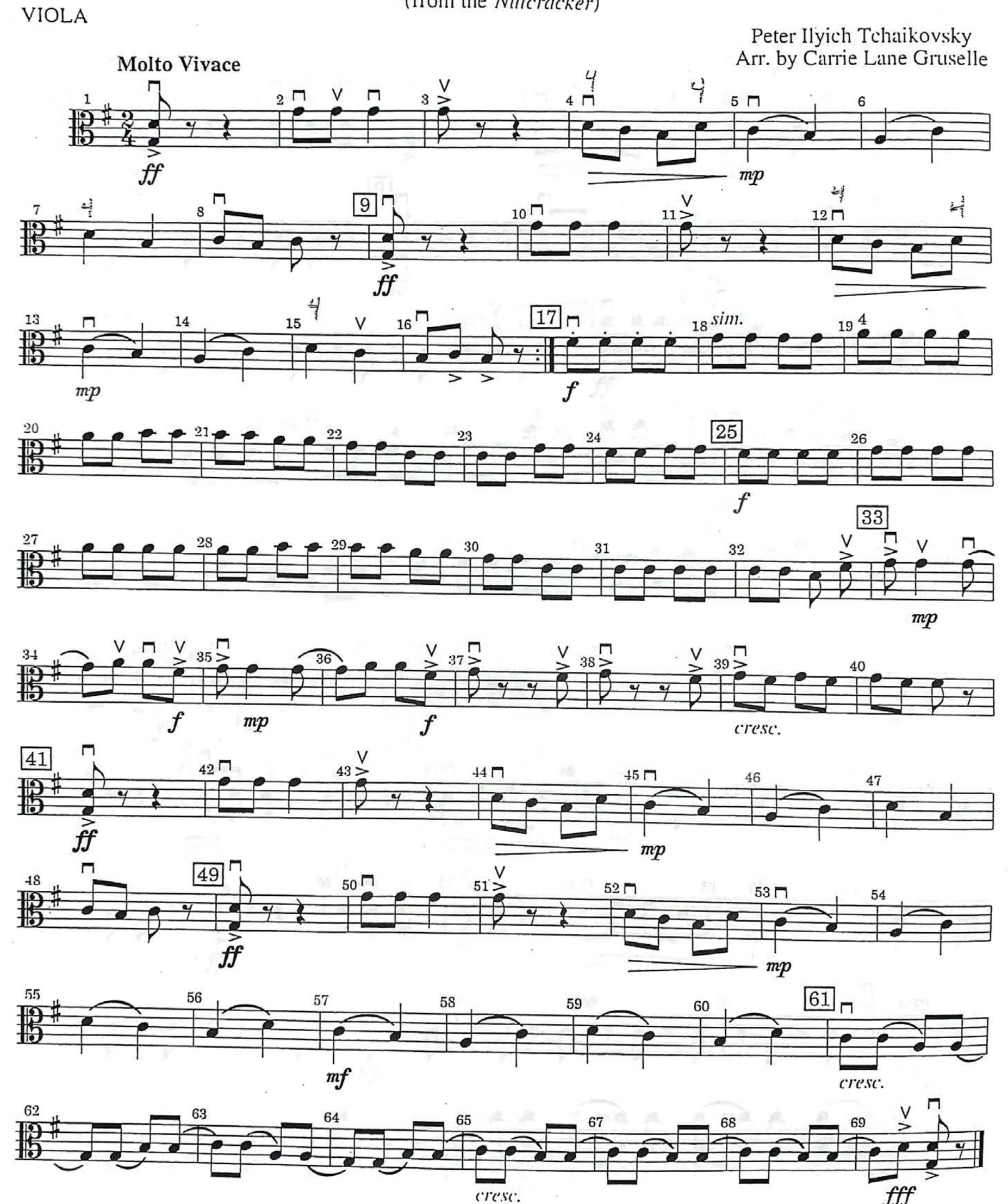
Copyright © MCMXCV by Highland/Etling Publishing, a division of Alfred Publishing Co., Inc.